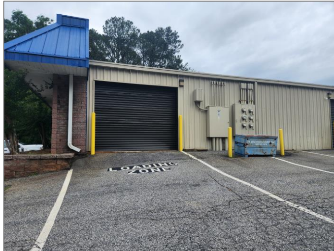
Exterior Drive-in Door at Rear

Interior photos are not representative of actual space