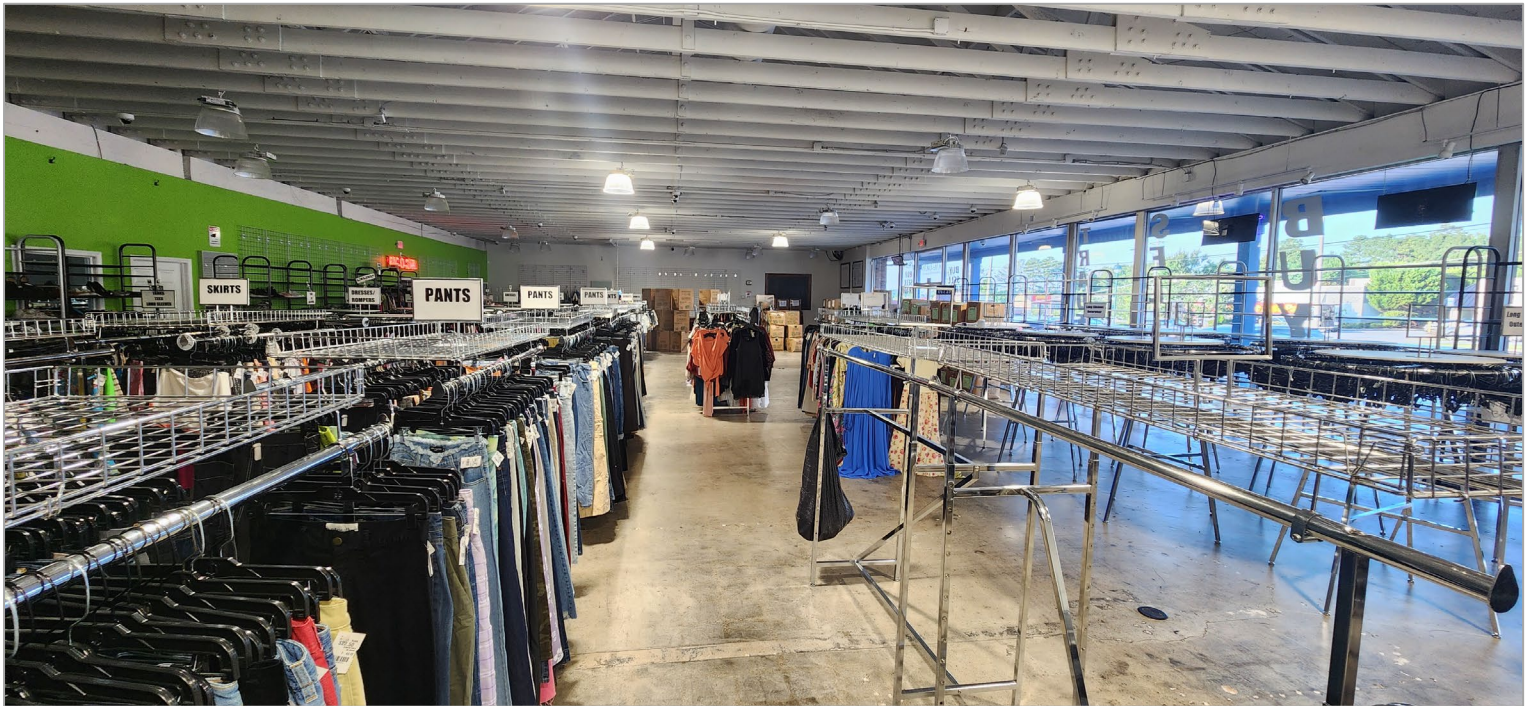
Interior View- Rear to Front