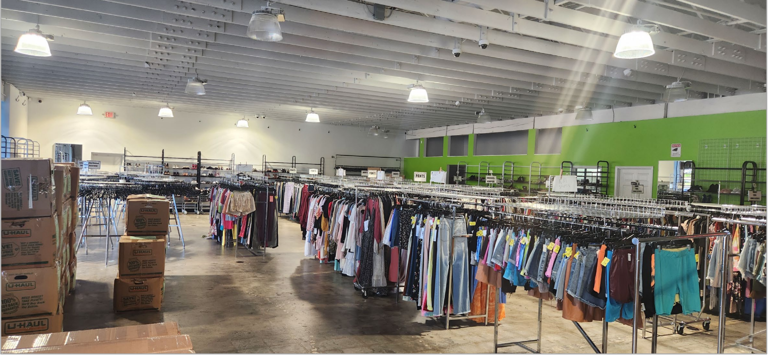
Interior View- Front to Rear