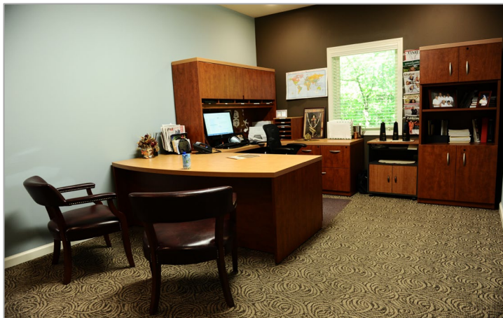
Corner Executive Office