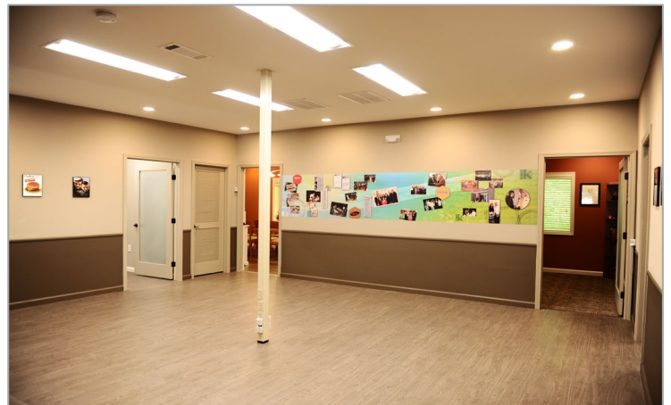
Expansion Space for Cubicles