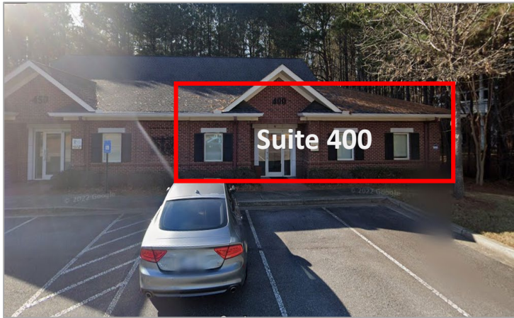
Building Front- Suite 400