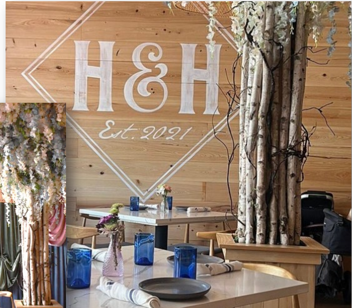
*Interior picture of Hamp & Harry's on-site restaurant